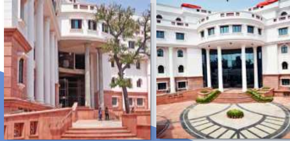
Dharohar Bhawan – The office complex of Archaeological Survey of India at New Delhi