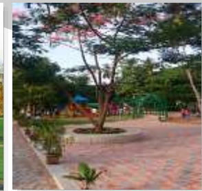
Renovation & Beautification of Botanical Garden, Puducherry