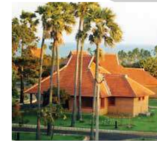
Cottage & Allied Facilities at Vivekananda Kendra, Kanyakumari