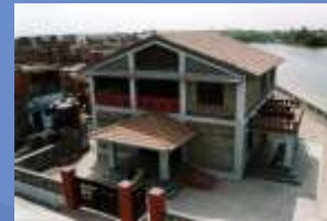
Integrated community assets complex, Tikri khurd, Delhi