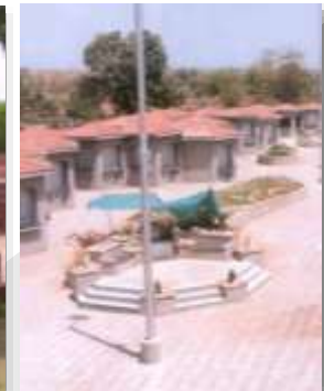
Shopping cum Modal interchange node, Ajanta Caves