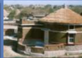
Interpretation centre, at ASI complex Dholavira (Gujarat)