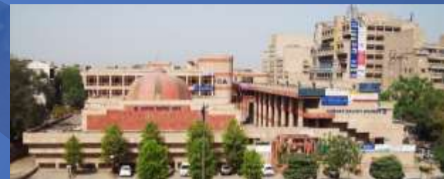
August Kranti Bhawan at Bhikaji Cama Place, New Delhi

HUDCO has undertaken construction and project management consultancy assignments and has played a key role of project coordinator for planning, designing & execution of the construction works.