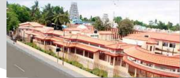
Queue Complex, Lord Darbaraneswara Temple, Thirunallur

HUDCO has designed several prestigious tourism related projects across many states in India. HUDCO has also undertaken area improvement projects around Heritage sites, including World Heritage Sites.