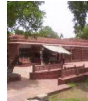
Shopping Complex & Interpretation Centre, Fatehpur Sikri