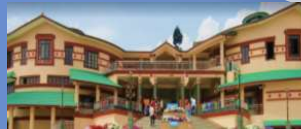
Pilgrim & Cultural Centre, Namchi, Sikkim