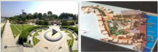
Sabarmati River Front Development, Ahmedabad

HUDCO has undertaken Environment Engineering consultancy in various sectors including preparation of Plans, DPRs & Feasibility studies on urban water & sanitation, solid waste management and third party evaluation of central schemes etc.