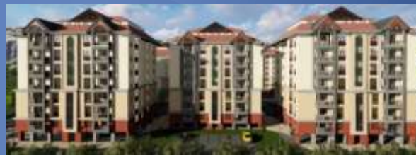
Vertical Housing Shehjar Apartments, Srinagar

HUDCO's Architectural Consultancy has close to five decade of experience in group housing, low income housing, post disaster rehabilitation & Institutional design