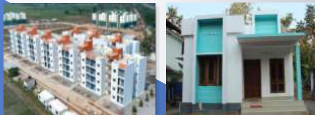
Scrutiny of DPRs & Site inspection under Pradhan Mantri Awas Yojana (Urban)

HUDCO has been providing invaluable technical support in scrutiny of project DPRs, monitoring of physical and financial progress of various flagship programmes of the Government of India.