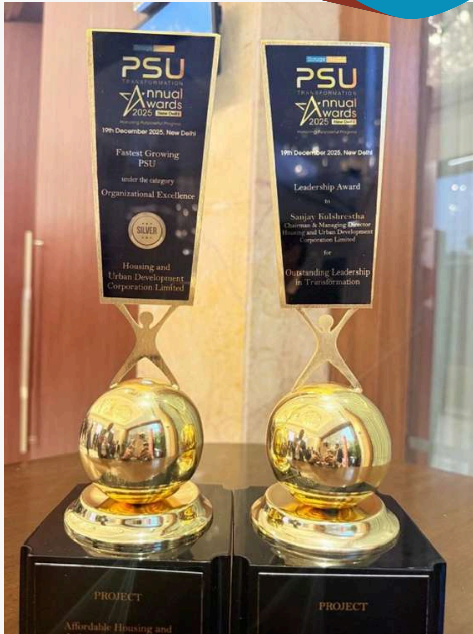
HUDCO recognised with two prestigious awards at 5 th PSU Transformation Awards 2025